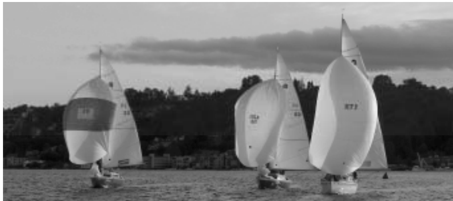
Lake Washington Racing

Non-Owners & Crew: _____ $30.00 = Associate Fleet ($15) + ITCA member ($15)