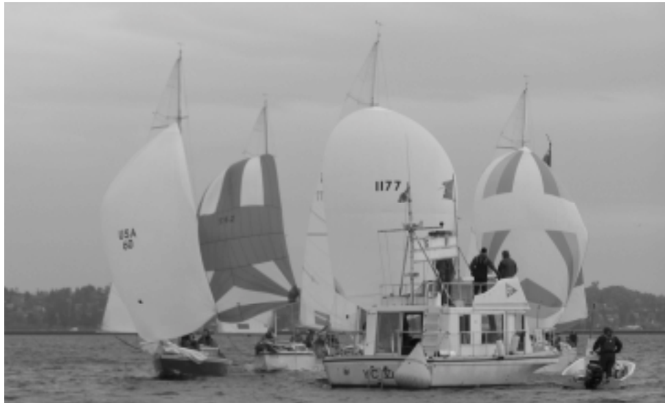
Lake Washington Racing