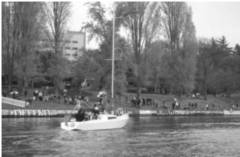
Invader at Opening Day 2008

P.S. If enough people bring sailing dinghies, we may have a little race off the dock too.